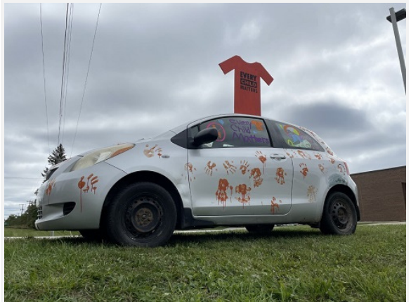
"Orange Shirt Car" designed by Grey Highlands Secondary School students and staff

On September 30, 2021, Canada observed the first ever National Day for Truth and Reconciliation, which coincided with the annual tradition of Orange Shirt Day. In Bluewater District School Board, flags were lowered at schools and work sites, while students and staff wore orange and participated in Truth and Reconciliation activities throughout the week. From collaborative whole school art projects and traditional ceremonies, to drama presentations and guest speakers, students were involved in many creative and thought provoking initiatives. Staff also engaged in various learning opportunities, including a live virtual presentation with educator and writer Dr. Niigaan Sinclair on how we can influence and empower through education, and be an ally. This occasion was just one opportunity to broaden our learning and understanding of the long-lasting damages of the residential school system on Indigenous Peoples and communities, and to honour victims, survivors, and others who have been impacted. View our web article.